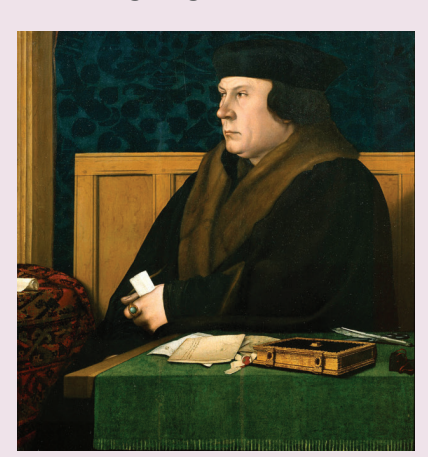
"Get thee from a friary" - Portrait of Thomas Cromwell, Hans Holbein the Younger (1533) - The Frick Collection

Austin Friars adds a footnote to its rich history as The City of London Environmental Enhancement team undertakes public realm improvement works. The City's Bank Area Strategy 2013 identifies Austin Friars as one of the High Priority Courts and Lanes projects, supporting the east-west movement of pedestrians along alternative routes to 'by-pass' Bank Junction. The team are re-paving the footways in Austin Friars, raising the carriageway to footway level, enhancing the soft landscaping, providing new seating, and installing new energy efficient lighting.