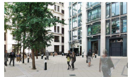
Austin Friars Square

Also in the Ward, Austin Friars has undergone significant improvements, as part of the City's street enhancement strategy, to improve the environment, particularly for pedestrians making their way between Moorgate and Old Broad Street.