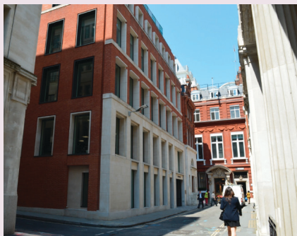
Tokenhouse Yard (8-10 Moorgate)

The Committee's role is to ensure that the City has the infrastructure necessary to maintain its position now, and in the future, as the world's foremost Financial and Professional Services Centre and meets the needs of its businesses, workers, residents and visitors whilst safeguarding and promoting its important historic and cultural environment.