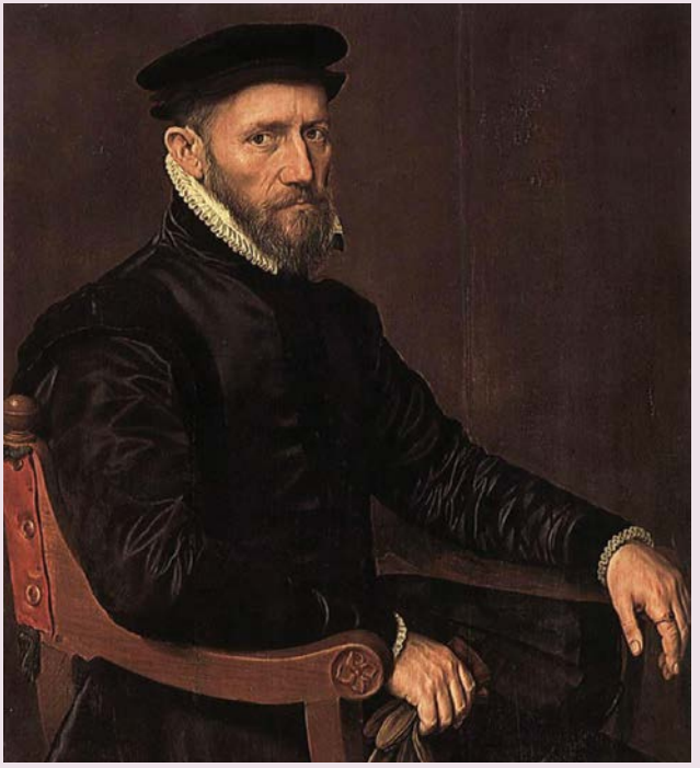
Sir Thomas Gresham

Broad Street ward should be very proud of its role in nurturing the wonderful Gresham College, London's first ever higher education institute. The College's birthplace in 1597 was a magnificent mansion on Bishopsgate, just off Broad Street, former home of its founder, Sir Thomas Gresham. Arranged around a quadrangle just like an Oxbridge College, the house remained the residence of Gresham College until 1768. You can see a plaque on the site of the old NatWest Tower (Tower 42).