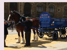
Cart Marking in Guildhall Yard