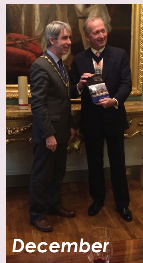
December Visit to Dublin - Lord Mayor & Lord Mayor of Dublin