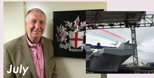
July On board HMS Illustrious HMS Queen Elizabeth naming ceremony flypast