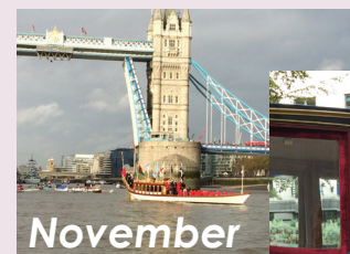
November Lord Mayor's Show – Gloriana at Tower Bridge