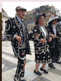
Pearly Kings & Queens – Guildhall Yard