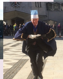
Poulters' Pancake Race – Guildhall Yard