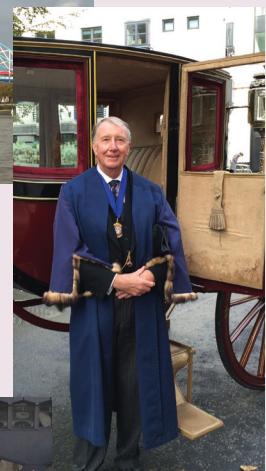
Lord Mayor's Show – Chief & Coach