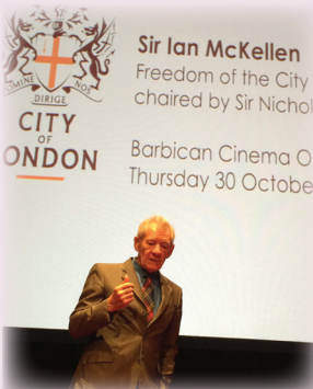
Sir Ian McKellen