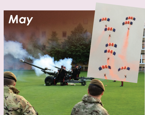
May HAC Open Day – Artillery salute & Group parachute jump