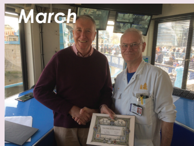
March Chief opening Tower Bridge