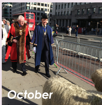
October Woolmen's Sheep Drive – London Bridge