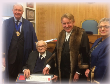
Sir Nicholas Winton