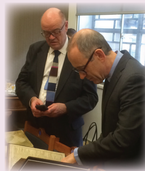
Sir Nicholas Hytner