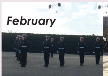
February Royal Marines Pass Out ceremony – Commando Training Centre