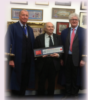
Sir Quentin Blake