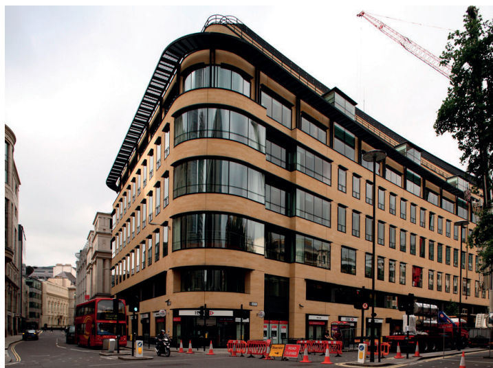
Winchester House looking south

A number of smaller scale improvements are being made in the area, which include improved access, particularly for those with disabilities to 15 Austin Friars. Austin Friars was originally an Augustinian Friary and later the home of Thomas Cromwell.