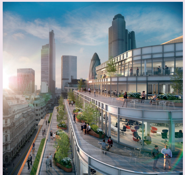
60 London Wall looking east (impression)

It is an environmentally friendly building achieving a BREAM excellent rating. The cycle provision has been doubled and all the car parking has been removed except for accessible parking. Relocating the service access to the north has ensured pedestrian access only along Angel Court. The 4 retail units enliven the public realm and have all been let. Peruvian restaurant Coya