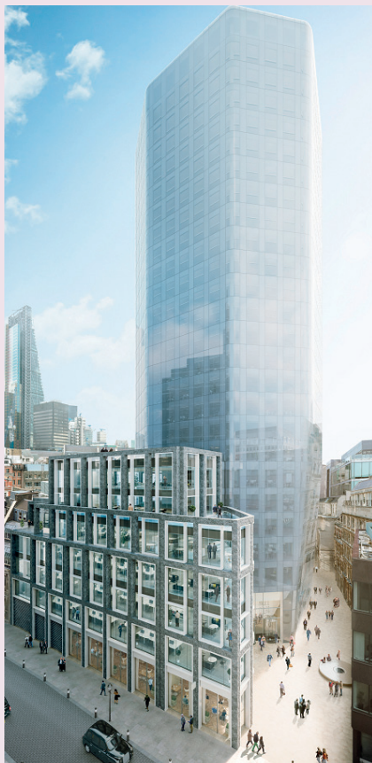
Angel Court from Throgmorton Street (impression)

Angel Court has been particularly successful having won many architectural and construction awards including Tall Building of the Year 2017 in the AJ Architecture awards. The scheme provides 300,000 sq. ft net of high quality, flexible offices creating a space for over 3,000 workers, including 15,000 sq. ft of retail and creates 30% more public realm than the original building along Angel Court. It has a