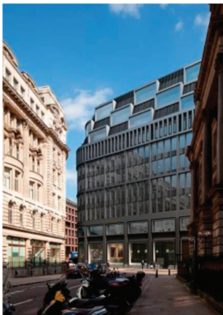
1 Liverpool Street looking east (impression)

As Crossrail nears completion the site of 1 Liverpool Street will become available