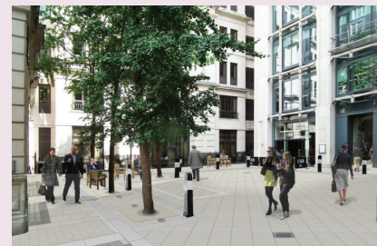
Austin Friars Square - Public Realm Improvement (2015)

Church was rebuilt from 1950-55. Princess Beatrix (former Queen) of the Netherlands visited the Church in April 2015 to celebrate three prominent milestones, the official opening of the Dutch Centre, the Koning Willem Fonds 140th anniversary, and the 465th year of the Church.