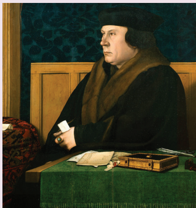
“Get thee from a friary” - Portrait of Thomas Cromwell, Hans Holbein the Younger (1533) - The Frick Collection

Austin Friars adds a footnote to its rich history as The City of London Environmental Enhancement team undertakes public realm improvement works. The City's Bank Area Strategy 2013 identifies Austin Friars as one of the High Priority Courts and Lanes projects, supporting the east-west movement of pedestrians along alternative routes to 'by-pass' Bank Junction. The team are re-paving the footways in Austin Friars, raising the carriageway to footway level, enhancing the soft landscaping, providing new seating, and installing new energy efficient lighting.